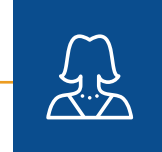
Subject Matter Analysts